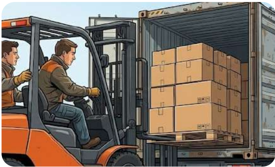
Weekly In-house Consolidation Service