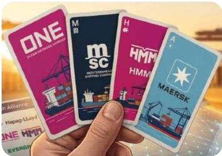
Flexible Scheduling Options

Flexible Scheduling through Partnerships with Various Shipping Lines